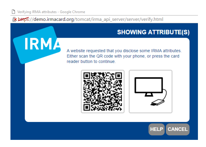
Figure 6.1: IRMA QR-example

First of all we tried to provide some wrong input ourselves via manual fuzzing. Our primary focus was the QR-code that CardProxy scans verify attributes: