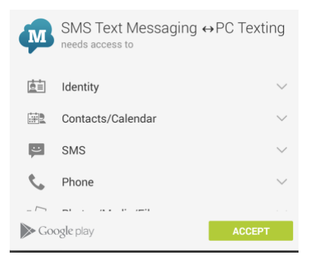
Figure 5.1: Example of Android app store permissions

Before installing an application the Android OS shows you a message box with information about permissions that a specific application is requesting. An example: