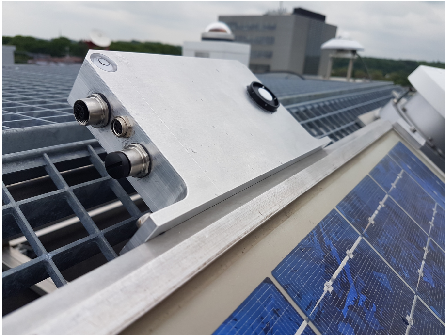
Figure 3.1: The ReRa Solutions solar sensor installed next to a solar panel.

Because of the problems arising when using WiFi, ReRa Solutions wants an alternative to WiFi.