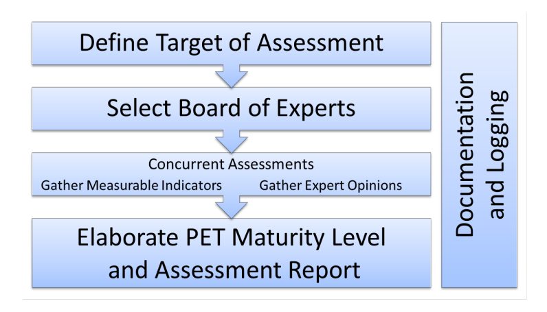
Fig. 2. Overview of the PET Maturity Assessment Process

Once the Target of Assessment is defined, the next step consists in gathering the board of experts to be asked for their opinion. Ideally, the experts should have expertise both in the domain of application the PET is evaluated for, and in the privacy engineering discipline. As with the assessor, it is necessary to gather an unbiased, objective, heterogeneous set of experts for this task (cf. Section 4.4), as far as this is feasible. Though there is no upper bound on the number of experts, we propose a minimum of five experts to be involved in the board.