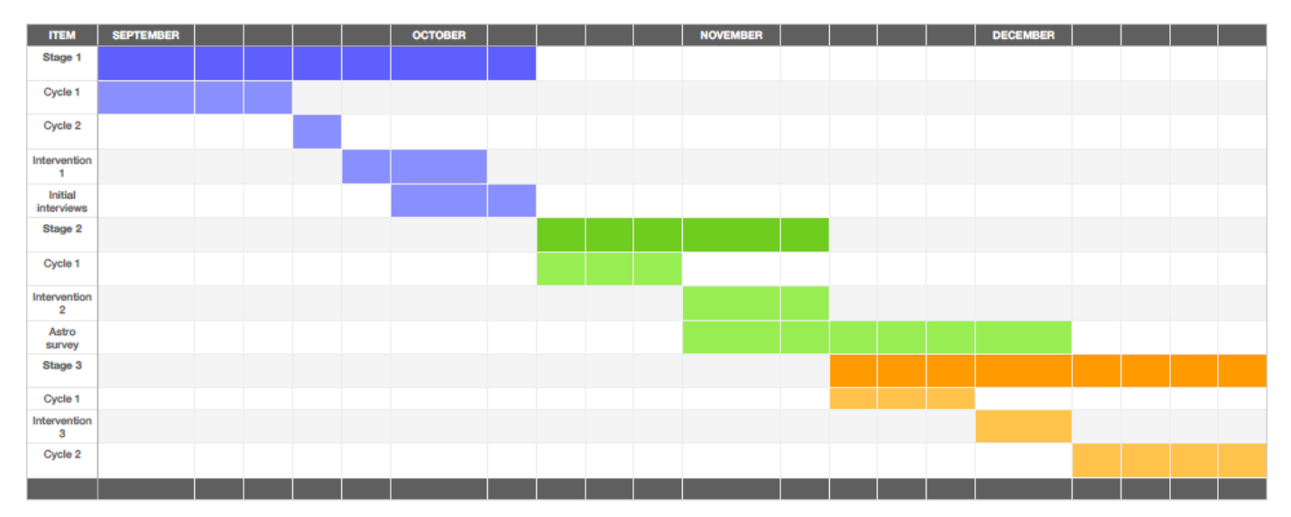
Figure 1: Stages and cycles within project, September-December 2020

This project consisted of three stages, each with one or two cycles of variable length. Each cycle contained the phases described above. However, each phase was not strictly followed according to the points described. For example, during evaluation, no statistical analysis was carried out, and the impact of the action was determined by means of observation and acknowledgement of the software team members.